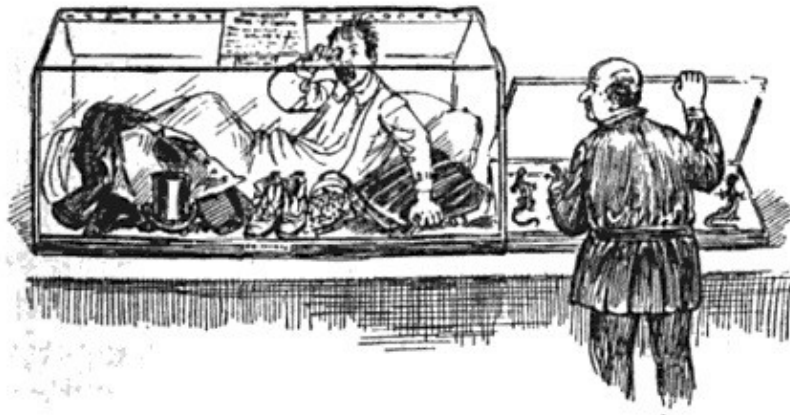
MAN—ASLEEP. PERIOD—19TH CENTURY.